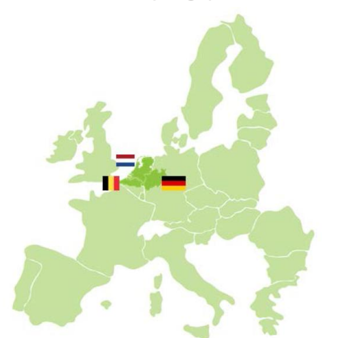
BIG-C Bio Innovation Growth (mega) Cluster