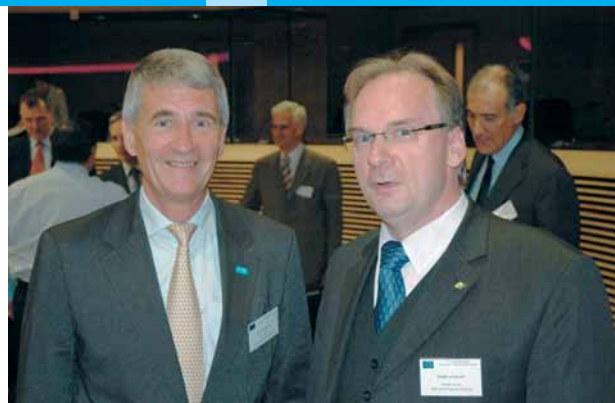
ECRN President and Minister of Economy Saxony-Anhalt Rainer Haseloff meets the Chairman of the Board of Executive Directors of BASF, Jürgen Hambrecht

ECRN President Haseloff outlined in his statement the role of the ECRN and the chemical regions in finding solutions on the ground to key questions regarding competitiveness. He referred to the ECRN as a network, which represents nearly 1 million employees in the chemical sector in Europe. He thanked the Commission for inviting the ECRN as the first regional network to take part in such a high level dialogue and he promised that the ECRN