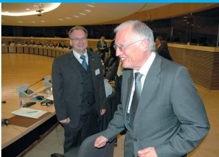
Talks beside the HLG: ECRN President and Minister of Economy Saxony-Anhalt Reiner Haseloff and Vice-President of the European Commission Günther Verheugen

European Commission Vice President, Günter Verheugen, responsible for enterprise and industry policy and chair of the HLG, stated that the EU chemicals industry is a world leader today and makes an enormous contribution to growth and jobs in Europe. However, there are clear signs that it is facing unprecedented challenges both from the effects of global change and the expectations of our citizens. With this initiative the EU aims to ensure the right framework conditions for the chemicals industry to continue operating and investing in the EU on a sustainable basis.