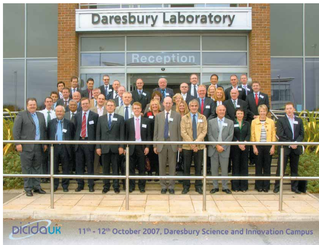
Participants of DICIDA Conference 2007