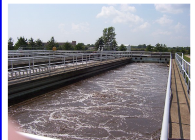
Over 90% of waste water collected in Europe's largest cities undergoes the biological treatment required.