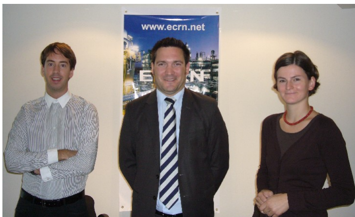
ECRN Team in September 2009!

Director of the ECRN Network Secretariat