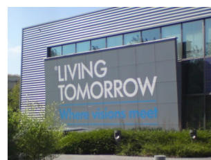
Entrance of Living Tomorrow exposition

In case of any questions, please contact the ECRN Network Secretariat.