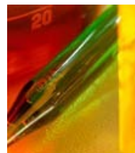
ICCA has published a global report on the carbon life cycle analysis of chemical products