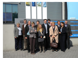
Members of ECRN at the Living Tomorrow exposition in Vilvoorde