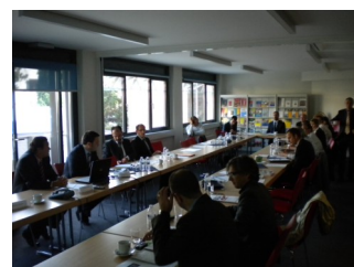
ECRN Seminar on Innovation on 17th Sept. 09

In the morning of the same day, essenscia Wallonia had invited ECRN members to a guided visit to the "Living Tomorrow" exhibition project in Vilvoorde, where it was demonstrated impressively how sustainable living and working could look like in the future. ECRN thanks essenscia Wallonia for this interesting event.