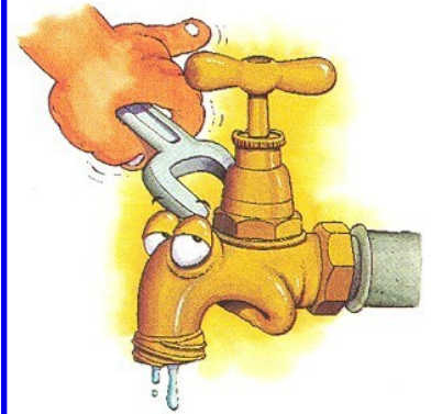
The state of waste water treatment in the EU is improving but more remains to be done.

For further information on this article, please consult the Agence Europe website.