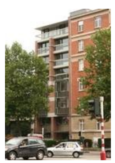
ECRN Office in Brussels

Phone: +32 (0) 2 7410 947 Fax: +32 (0) 2 7410 927 E-mail: office@ecrn.net Web: www.ecrn.net