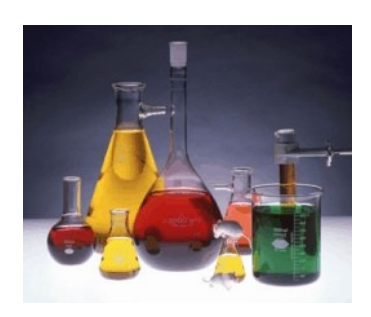
Only 2 months left for the Downstream Users of chemical substances to inform their suppliers.

For further information, check the ECHA website www.echa.eu