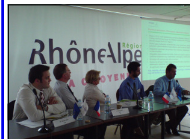
Our new member region, Rhône-Alpes, was the host of this seminar

We would like to thank our partners in Rhône-Alpes for the perfect organisation and the warm welcome in their beautiful region!