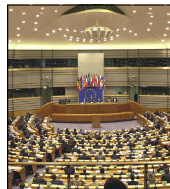
European Parliament members will be present in February

For further questions on these issues, please contact the ECRN Secretariat.