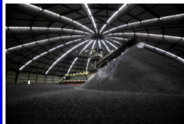
Carbon captured and stored underground

For further information about this article, please consult the Agence Europe website.