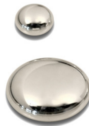
Also known as 'quicksilver', this chemical element is extremely rare in the Earth's crust