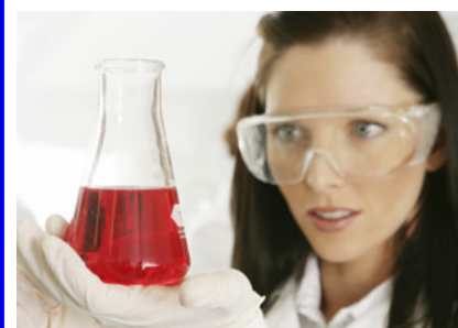
Pre-registration should be taken more serious