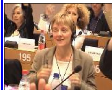
PSE Vice-President Linda McAvan