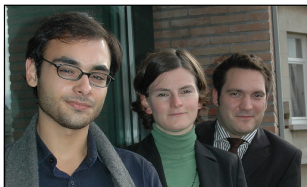
ECRN Team October 2008