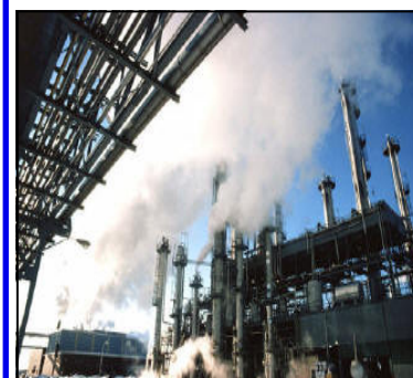
Competitiveness of European industry maybe in danger

The EPP-ED Group supports free allocations of the emissions certificates for every level of the industry (under determined conditions) and not only for some. The EPP-ED is accordingly against the 'auction' model to sell the emission certificates. 'Producers should be able to invest money in internal climate protection measures', said MEP Karl-Heinz Florenz (EPP-ED Germany).