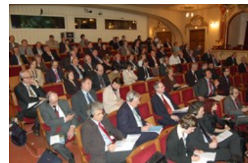
Ústí nad Labem conference

of the panels and workshops in order to give a good overview on the conference. The ECRN Secretariat will inform you as soon as the report is available.