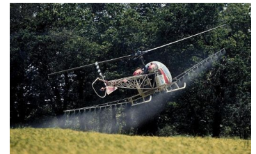
Like this crop duster in action, many MEPs want to swoop low and target toxic chemicals in pesticides.

For further information on this article, please consult the Agence Europe website.