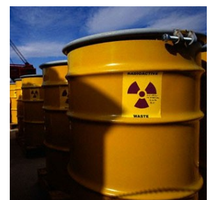
Nuclear waste program accounts for total revised budget of €676 million, which has increased €38 million compared to forecasts.

For further information on this article, please consult the Agence Europe website.