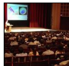
REACH implementation workshop

For further information, please contact: Clarissa Spencer on 0032-(0)2 676 74 02 or refer to http://cefic.org/en/689.html