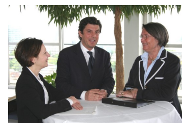
HLG Conference in Düsseldorf