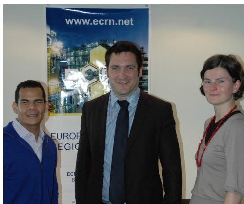
ECRN Team May 2009