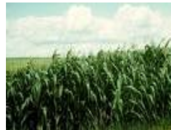
Europe GM maize field

http://www.icis.com/Articles/2009/05/11/9213552/are-chemical-producers-engaged-in-the-drive-to-use-green.html