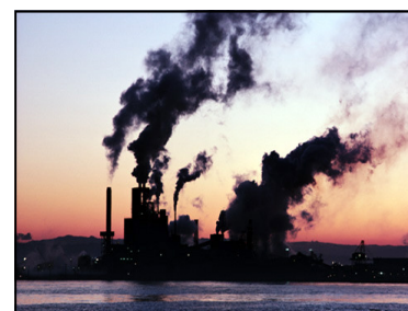
The implementation will cover 52,000 industrial plants

For more information please consult Agence Europe.