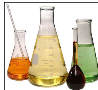
Suppliers of chemicals have to evaluate the chemicals and classify and label them

http://echa.europa.eu/classification_en.asp