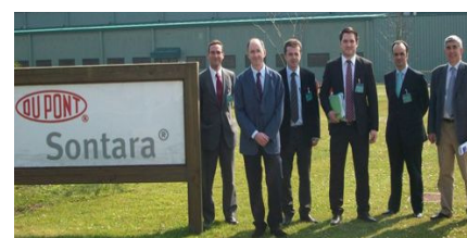
ECRN Director meets stakeholders in member region Asturias