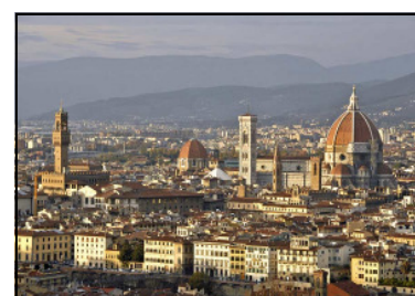
The Forum took place in Florence