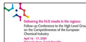
HLG Follow up conference in Ústí