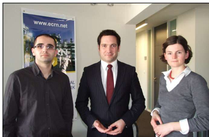
ECRN Team March 2009