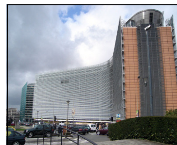
Conference on CLP organised by the European Commission

http://ec.europa.eu/enterprise/reach/information/events/index_en.htm