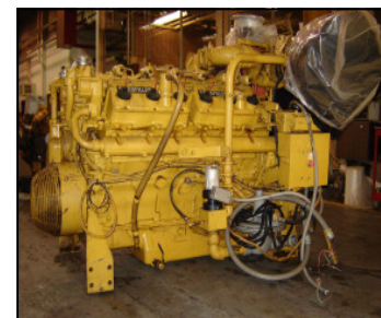
This regulation will reduce the electricity consumption of industrial engines

For further information on this article, please consult the Agence Europe website.