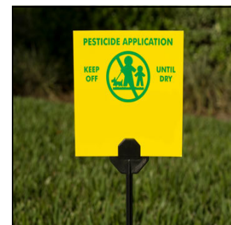
Pesticides new program after 16 years of review

http://www.euractiv.com/en/cap/eu-completes-16-year-pesticide-review/article-180313