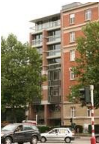
ECRN Office in Brussels

Phone: +32 (0) 2 7410 947 Fax: +32 (0) 2 7410 927 E-mail: office@ecrn.net Web: www.ecrn.net