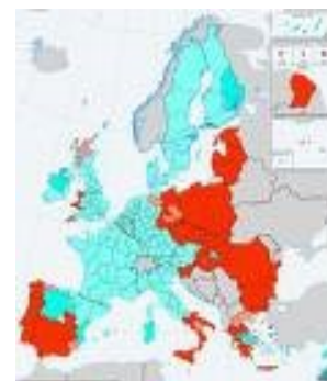
The European Cohesion Policy is an important instrument to foster European regional development and competitiveness

For more information, please refer to http://www.eumonitor.net and the European Commission Website http://ec.europa.eu/social/main.jsp?langId=en&catId=736