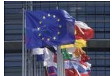
In the WTO the European Commission speaks on behalf of the 27 member states