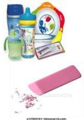
Phthalates in school supplies like in rubbers are not a serious danger for children, as a recent study found

For further information on this article, please consult the Agence Europe website.