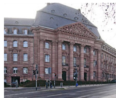
Landeshaus in Wiesbaden, seat of the Economic and Transport Ministry of Hesse

Saxony-Anhalt was the host of a regional HLG-implementation conference