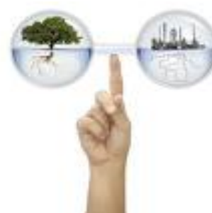
Chemical industry as climate saver?