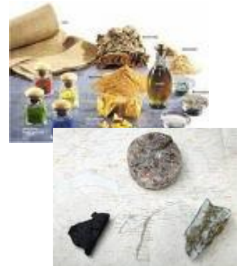
China owns some raw materials which cannot be found anywhere else in the world. Restrictions on export for these materials are a big problem for others

For further information on this article, please consult the Agence Europe website.