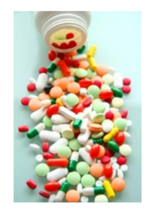
EU is one of the world's main sources of synthetic drugs