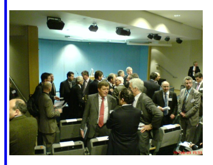
PWG meeting participants