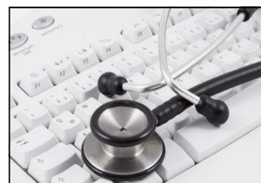
ECHA's IT problems were predicted by some, with which the Agency tried to cope rapidly