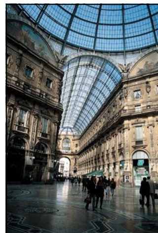
Galleria Vittorio Emmanuelle, Milan