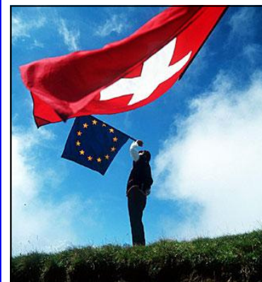
Swiss press say that participation in EU rules would be the solution for national post-REACH chemical sector complications