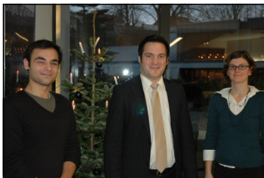
ECRN Team wishes you a Merry Christmas