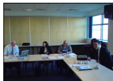
Humber Meeting Facilities

For any information on the PWG in Humber or on the meeting in Brussels, please feel free to contact the ECRN Secretariat at any time!