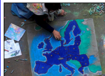
The puzzling application of Community Environment Law to become simpler with Commission's help