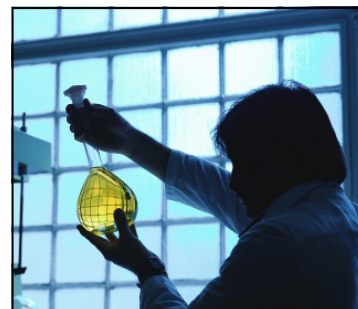
Worldwide standards for labeling and classification of chemicals were agreed...