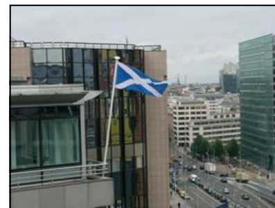
Scotland Europe office in Brussels

In case of any questions, please contact the ECRN Network Secretariat.