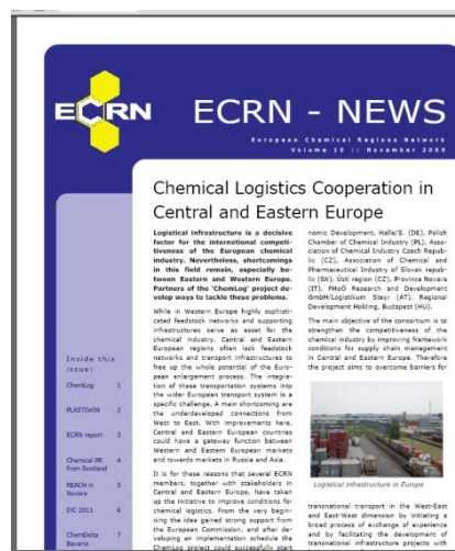
Volume 10 of the ECRN Newsletter, November 2009