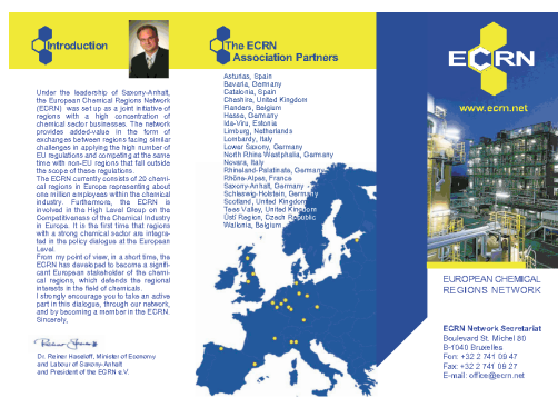
ECRN Flyer in 2009

In order to offer an overview on the economic and geographic situations of the ECRN member regions and to give up-to-date contact details of representatives in the regions, the ECRN updated the “who-is-who of the chemical regions” and published it on its website in by the end of October. The 80-page- document gives an exhaustive insight into the ECRN regions’ general economic structures, the situation of the chemical industry more specifically, information on infrastructure, education possibilities, contact persons etc. It will help external and internal stakeholders to get to know the ECRN regions better and to get in touch with them more easily.