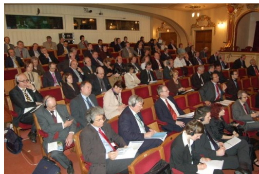
HLG Follow-up Conference on 16 th /17 th April 2009 in Ústí nad Labem/ CZ

The latter was done among other things by the adoption and distribution of an ECRN Congress Declaration on the HLG results, which will be presented in more detail under “Joint position papers” below.