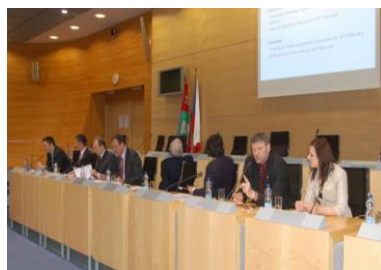
Executive Board Meeting in Ústí, April 2009

Apart from the PWG meetings and the General Assembly, meetings of the ECRN Executive Board took place in April and November (16 th April and 6 th November). Among the decisions taken by the Board was the final adoption of two joint ECRN declarations which were then addressed to European policymakers and chemical stakeholders on the occasion of the HLG-Follow-up Conference in Ústí nad Labem in April and the 7 th Congress of the European Chemical Regions in Liège in November. The declarations will be mentioned in more detail below. Furthermore, at the Executive Board meeting on 6 th November in Liège, not only the approval of a latest funding application project could be announced, in which many ECRN members are involved, but ECRN President Dr. Reiner Haseloff also informed the Board members on the official application for ECRN membership of a new chemical region. After having gone through the approval procedure, the ECRN will probably welcome its 21st member at the beginning of 2010.