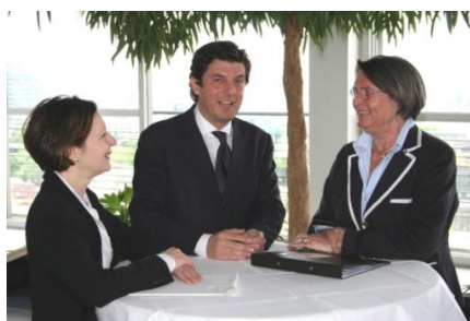
Regional HLG Implementation conference in North Rhine-Westphalia in April 2009

The Ústí Conference made clear the willingness of the ECRN member regions to actively contribute to the implementation of the HLG policy recommendations. Resulting from this fact, further regional HLG-implementation conferences were organized in several ECRN regions in the following months (e.g. North Rhine-Westphalia in April 2009, Saxony-Anhalt in July 2009, ...), where chemical stakeholders from the respective regions exchanged views and developed concepts for effective implementation of the HLG recommendations in their regions. The ECRN Secretariat strongly welcomed and supported the organization of these events.