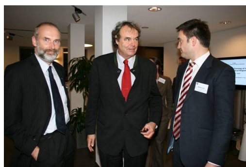
In constant dialogue in 2009: ECRN, the chemical industry and European policymakers

A first Parliamentary Evening of the European Chemical Regions took place in February and was hosted by member region Scotland in Brussels. In direct and informal discussions with MEPs representatives from the chemical regions had the opportunity to raise awareness among the Parliamentarians for their specific needs and situations at the time of economic crisis.