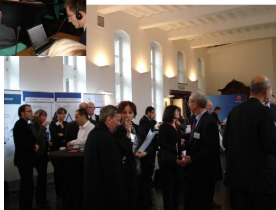
7 th Congress of the European Chemical Regions

Taking into account the current important political and structural changes in Europe after the Parliamentary elections in June, the coming into power of the Lisbon Treaty and the new European Commission about to assume office in January 2010, in November 2009 the ECRN organized a seminar on recent policy developments in cooperation with member region North Rhine-Westphalia in Brussels. Two representatives from the European Parliament and from CEFIC, thus representing the political and chemical lobbyist’s point of view, presented their experiences and their expectations and activities concerning European developments in the years to come and also got actively engaged in the following debate with seminar participants.