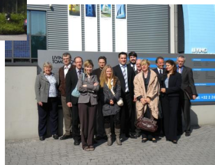
ECRN Seminar participants at „Living Tomorrow“ exhibition center