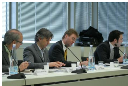
Permanent Working Group in February 2009

In order to enable a most effective dialogue on specific topics of special ECRN relevance, in 2009 the ECRN set up the idea of establishing specific working groups . Facing the vivid interest of some members in deeper engagement in area of skills, the first working group was set up on skills development and met for the first time on 17 th September 2009, following a public skills meeting with external stakeholders in February (see below) and an internal skills discussion within the PWG meeting in June.