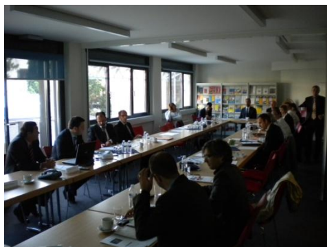
ECRN Seminar on innovation in September 2009

Innovation being another very important focus of the network’s activities, in the second half of 2009 two important public events were devoted to this topic: The first innovation event took place in September, when ECRN in cooperation with member region Catalonia and Essenscia Wallonie organized a seminar on innovation in Brussels. Speakers and participants from regions, clusters, associations and chemical industry discussed cross innovation, innovation networks and open innovation in chemical regions. The seminar was combined with a guided tour through the exhibition project “Living Tomorrow” in Vilvoorde where innovative and sustainable ways of future life and work environments were impressively presented in order to attract young people to the field of chemicals.