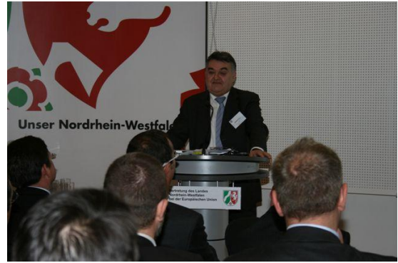
Parliamentary Evening of the European Chemical Regions, November 2009, North Rhine-Westphalia Office Brussels