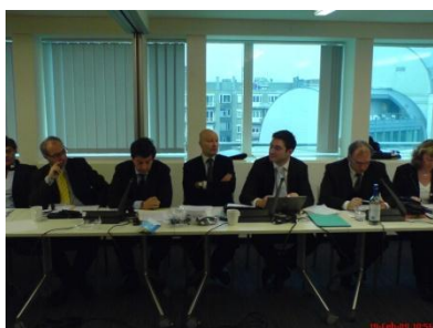
ECRN General Assembly Meeting February 2009

On 19 th February 2009, the annual ECRN General Assembly Meeting took place in the Scotland House in Brussels. It was the network's most important internal event of the year, since the General Assembly decided officially on working and budget plan of the association, and on the strategic direction the network should take for the year to come. The high number of participants from all 20 ECRN member regions and the vivid contributions and comments during the meeting underlined once more the attractiveness of the ECRN network and the members' will to actively contribute to the further development and growth of the network.