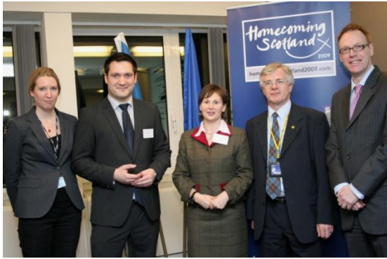
Parliamentary Evening of the European Chemical Regions, February 2009, Scotland House in Brussels